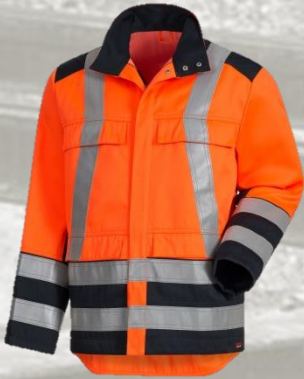
jacket Article No. 20050